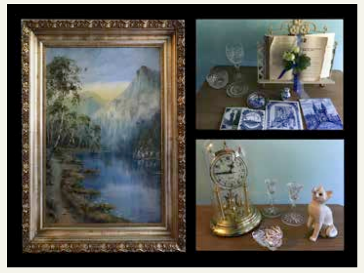
Some of the lovely objects donated and sold in last year's Landmark Lawn Sale.