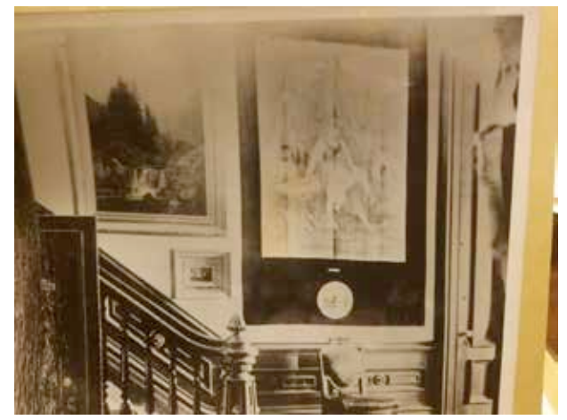
Tapestry wall hanging in 1880's photo

Rose Garden - A new fence is needed for the eastern border of the south lawn, so that plans can proceed for the restoration of Florence Bates's Garden. (The fence is approximately $1,200 and then donations toward the cost of topsoil, roses and annual flowers will be appreciated.)