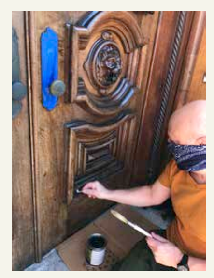
David D'Ambrosio sanded and put a fresh coat of marine varnish on the front doors.