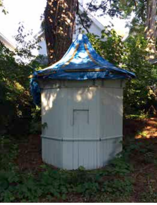
Octagonal Rubbish Shed