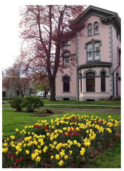
The beautiful spring garden of daffodils and tulips has blossomed thanks to the Oswego Garden Club and SUNY Oswego Rugby Team Partnership.

Have a green thumb and want to volunteer? Consider joining the garden committee to grow the Memorial Garden Project!